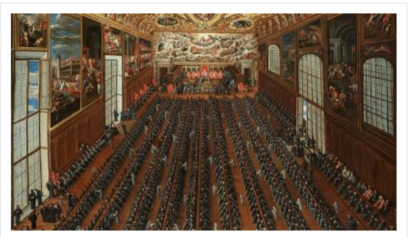
Joseph Heintz der Jüngere (1678): The Doge's Palace, Venice, with patricians voting on a bulletin for the election of new magistrates.

Sortition was abandoned during the Middle Ages but was readopted in the Renaissance in the northern Italian cities of Bologna (1245), Vicenza (1264), Novara (1287) and Pisa (1307) and especially in the great Renaissance cities of Venice (1268) and Florence (1328).<sup>[3]</sup> In Venice, ballote was used to appoint the doge. Venice was an oligarchy controlled by aristocratic families. In order to prevent tensions between them they used a pretty bizarre mixed electoral-aleatoric