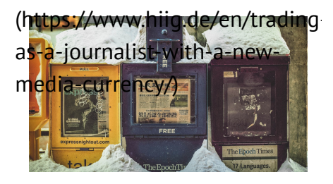
Trading as a journalist with a new media currency

By Natalie Pompe (https://www.hiig.de/en/author/n | 26 February 2019